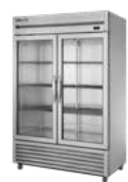
T-49G Glass door commercial refrigerator

Visit truerefrigeration.com.au for more options and sizes from the complete product range