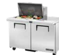
TSSU-48-12M-B Prep Counter with serve-over space