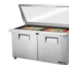
TSSU-60-24M-B-ST-FGLID Prep Counter with hydraulic glass lid