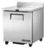
TWT-27 Most Undercounters are available with a 100mm back splash (TWT models)

Visit truerefrigeration.com.au for more options and sizes from the complete product range