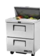
TSSU-27-08D-2 Prep Counter with drawers