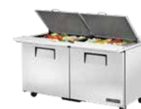
TSSU-60-24M-B-DS-ST Dual sided unit featuring removable lids and cutting boards both sides

Visit truerefrigeration.com.au for more options and sizes from the complete product range