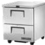
TUC-27D-2 1/1 GN pan accepting drawers, also available as a freezer