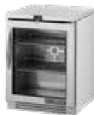
TUC-24G Glass door commercial Undercounter refrigerator