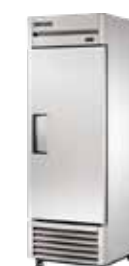
T-23PT "Pass Thru" unit with doors front and back