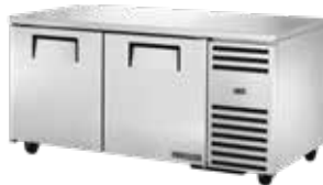
TUC-67 Deep undercounter unit with side-mounted system for additional capacity