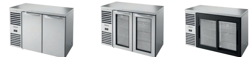
Door Types SOLID SWING DOOR GLASS SWING DOOR GLASS SLIDE DOOR

Mixed Solid Swing and Glass Swing doors can be configured. Glass Slide doors cannot be mixed with Swing options.